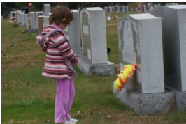
Every day anger leads to the death of loved ones.

Our Social Workers engage the learner throughout the course. The interactive sessions allow the student's name to remain confidential while encouraging their participation. The self directed modules are highly interactive and easy to navigate.