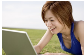
Today, online learning allows learners to work from home while offering anonymity.

Today online learning has become main stream, and with good reason. Studies have found increases in participation and attendance among those enrolled in an instructor led online course. Also, The anonymity provide by the